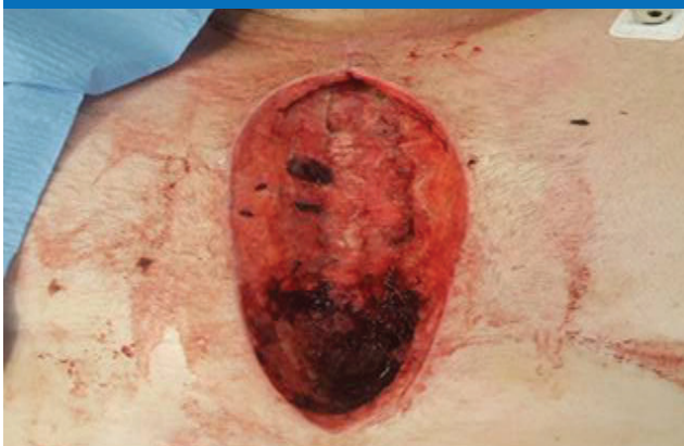
Before DermaClose, after 9 days of NPWT.