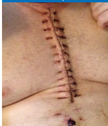
Day of closure, wound measured 23 cm x 3 cm x 1 cm. After closure, with retention sutures and staples.