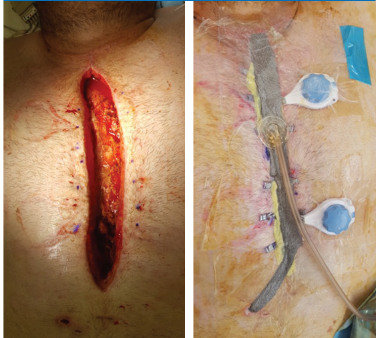
Wound as it appeared Just before the second application of DermaClose (left), and after application (right).