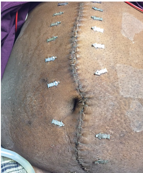
DermaClose skin staples applied approximately 3 cm from either side of the high tension incision.

Follow-up: We were very satisfied with the use of DermaClose. At follow-up 6 weeks post DermaClose removal, the patient was healing nicely with the exception of a small keloid which should soon resolve.